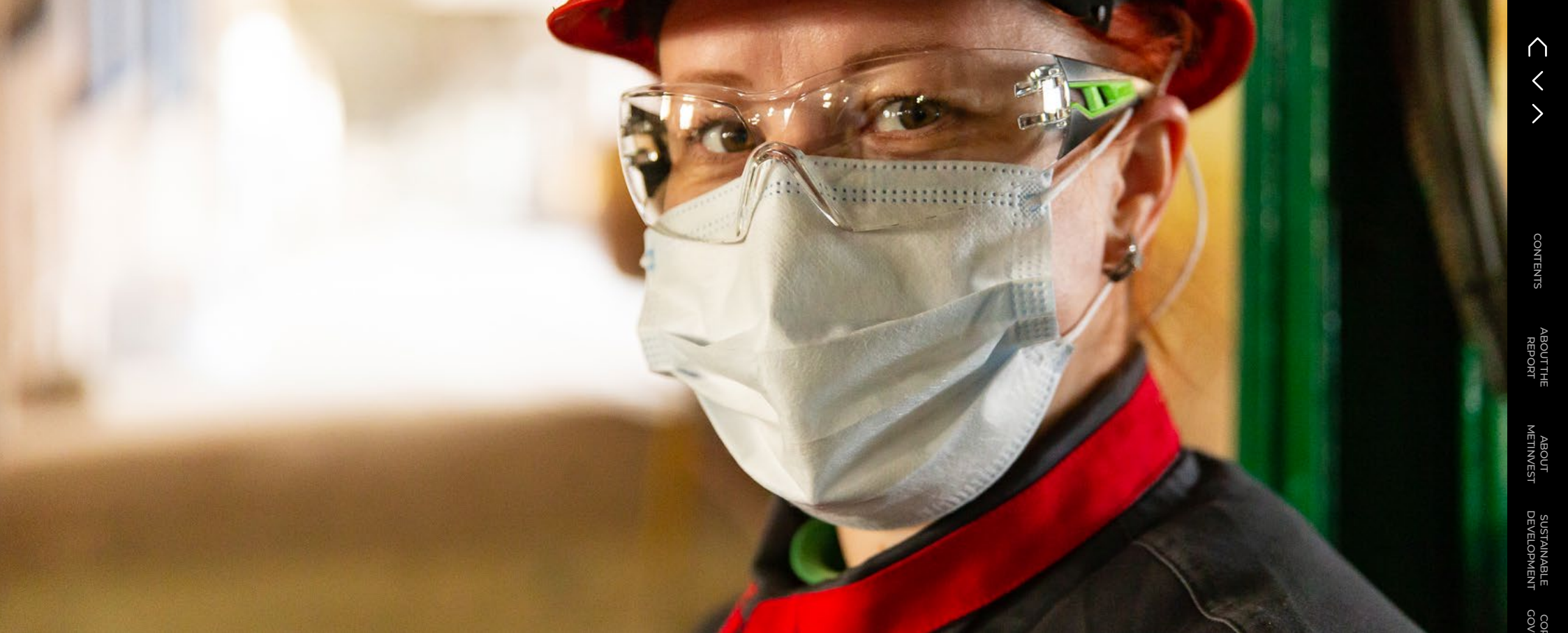
Total number of cases of workplace illness among Metinvest employees